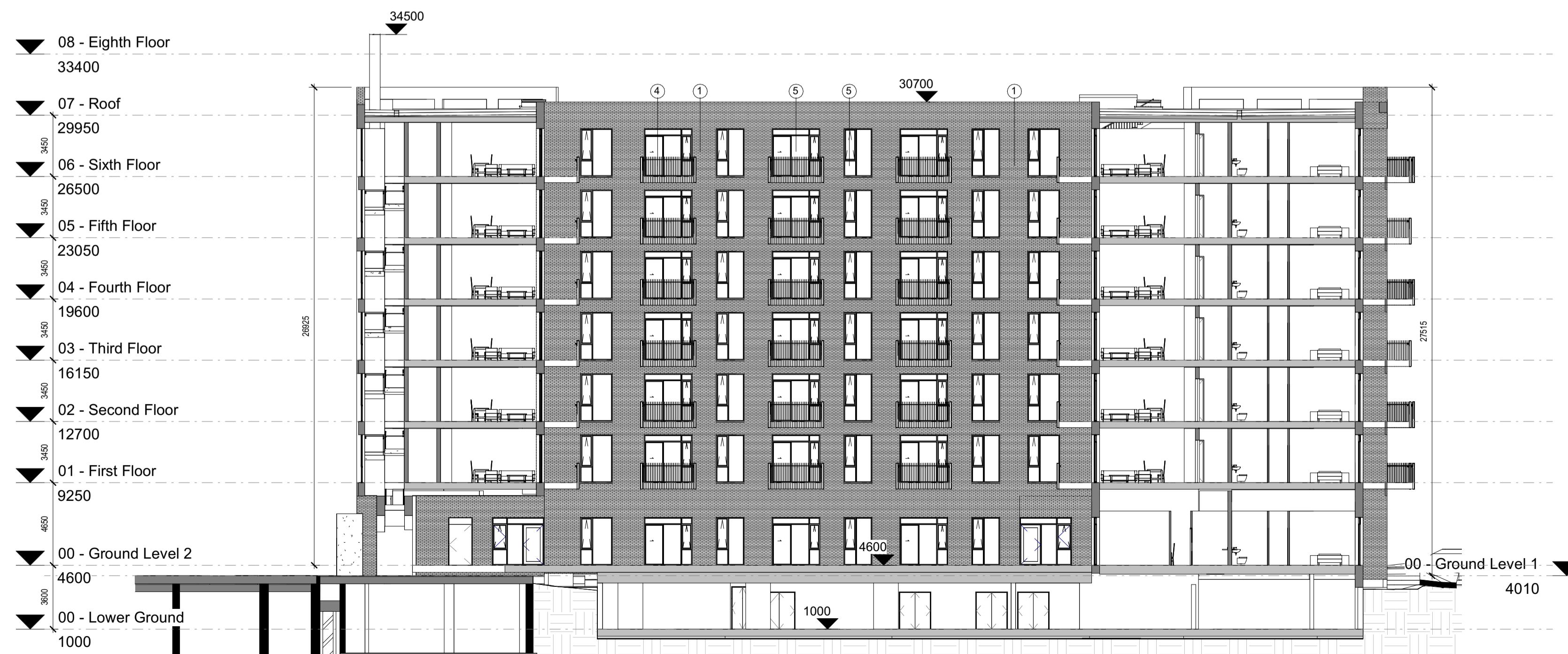
2 Block 1 - Section D-D 1 : 200

DRAWING ISSUED FOR PLANNING APPLICATION NUMBER: DSDZ4279/18 GRANTED: 18/12/2018