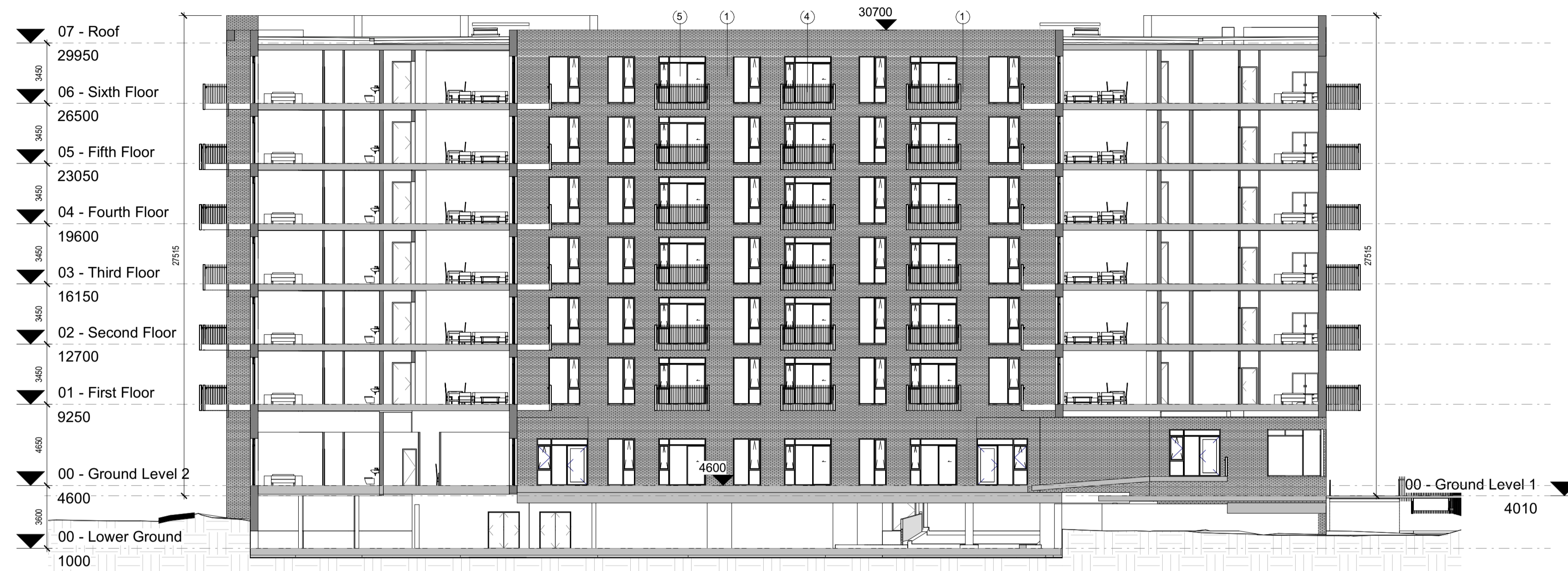
1 Block 1 - Section C-C 1 : 200

NOTE ALL DIMENSIONS TO BE CHECKED ON SITE NO DIMENSIONS TO BE SCALED FROM THIS DRAWING THIS DRAWING IS TO BE READ IN CONJUNCTION WITH RELEVANT CONSULTANTS DRAWINGS